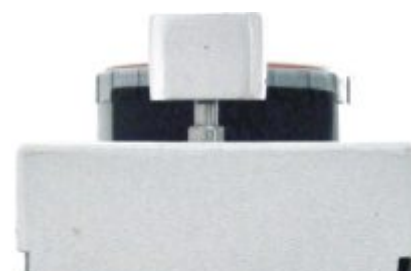
SELECTATEC Fitting with Interlock